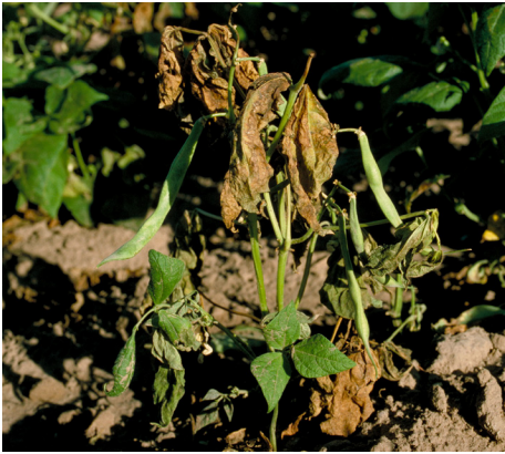
Figure 9: Foliar bacterial symptoms and wilt.