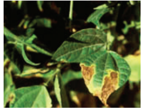
Figure 6: Mature common blight lesions.