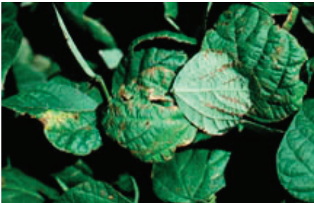
Figure 3: Young brown spot lesions.