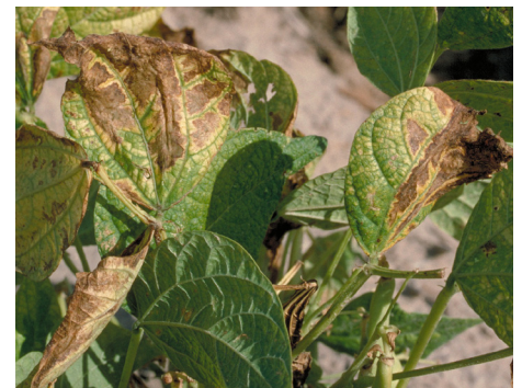
Figure 8: Foliar bacterial wilt symptoms.