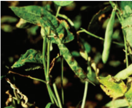
Figure 4: Brown spot lesions on pods.

blight symptoms on pods appear as small circular, water-soaked spots or streaks. A light cream or silver-colored bacterial ooze is often associated with these spots. Pod infection often causes discoloration, shriveling and bacterial contamination of seeds; however, some seed may appear to be healthy.