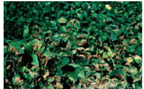
Figure 7: Foliar common blight symptoms.