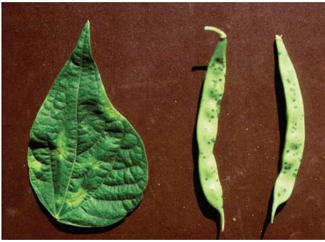
Figure 1: Initial halo blight symptoms.