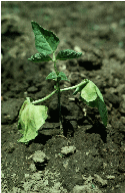
Figure 6: Pythium wilt.