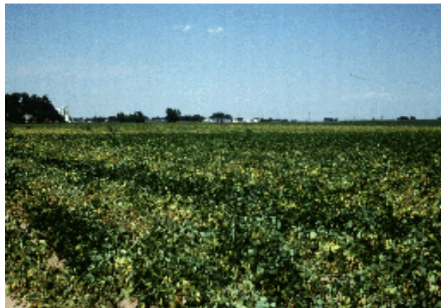
Figure 3: Fusarium wilt yellowing.

20 inches deep between bean rows, or 8 to 12 inches deep immediately in front of the planter and 1.5 inches to the side of the row. Perform routine cultivations carefully to minimize root pruning, and hence plant stress and increased infection. Pushing soil up around the base of Fusarium- or Rhizoctonia-infected plants before flowering can enhance lateral root development to reduce the damage caused earlier by root pruning and infection.