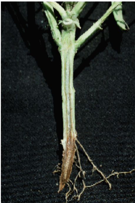
Figure 2: Fusarium wilt infection and vascular discoloration.