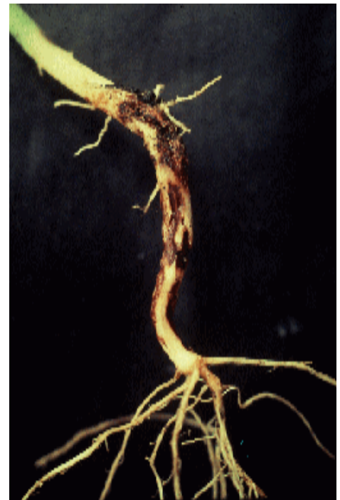
Figure 4: Rhizoctonia lesions and microsclerotia.

It must be emphasized that crop management will be most successful if the producer integrates the recommended strategies of crop rotation, planting date, planting rate, seedbed preparation, certified seed, fungicide treatments, herbicide and cultivation practices, and irrigation procedures.