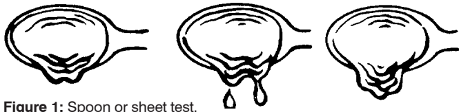
Figure 1: Spoon or sheet test.

per 1,000 feet above sea level). For an accurate thermometer reading, place the thermometer in a vertical position and read at eye level. The bulb of the thermometer must be completely covered with the jelly mixture but not touch the bottom of the kettle.