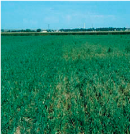
Figure 1: Xanthomonas leaf blight infection of susceptible yellow onion variety (right side); resistant white onion variety on left.