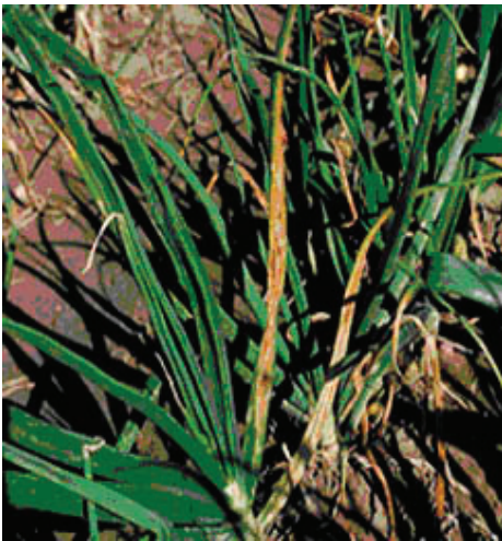
Figure 2: Xanthomonas leaf blight symptoms on older leaves of an infected onion plant.

Frequent rains after bulb initiation, especially when driven by strong winds, favor severe disease epidemics. Overhead irrigation and humid, overcast conditions also appear to favor the disease. Distinct disease foci can develop and lead to secondary spread of the pathogen when as little as 0.04 percent of seed is contaminated with the bacterium if abundant overhead irrigation is supplied to the crop. Frequent rains or overhead irrigation appear essential for seed contaminated with X. axonopodis pv. allii to produce an epidemic of Xanthomonas leaf blight in semi-arid environments.