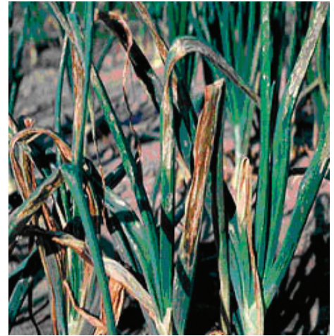
Figure 3: Xanthomonas leaf blight symptoms of onion; noted water-soaked lesions.

Plant seed, transplants and sets free of X. axonopodis pv. allii . Practice a two-year or longer rotation to a nonsusceptible host such as winter wheat or corn. Avoid close rotations of onion and garlic with