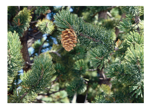
Figure 4: Bristlecone pine (Pinus aristata)