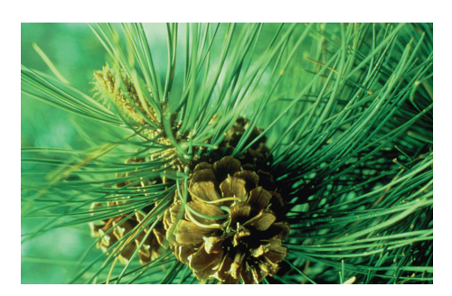
Figure 6: Douglas-fir (Pseudotsuga menziesii)

The Foothills life zone occurs from 5,500 to 8,000 feet and is dominated by dry land shrubs such as Gambel oak and mountain-mahogany, and in southern and western Colorado, piñon-juniper woodlands and sagebrush. The Montane zone consists of ponderosa pine, Douglasfir, lodgepole pine, and aspen woodlands at elevations of 8,000 to 9,500 feet. Dense forests of subalpine fir and Engelmann spruce dominate the Subalpine zone at 9,500 to 11,500 feet. The Alpine zone above 11,500 feet is a treeless zone made up of grasslands called tundra. Species