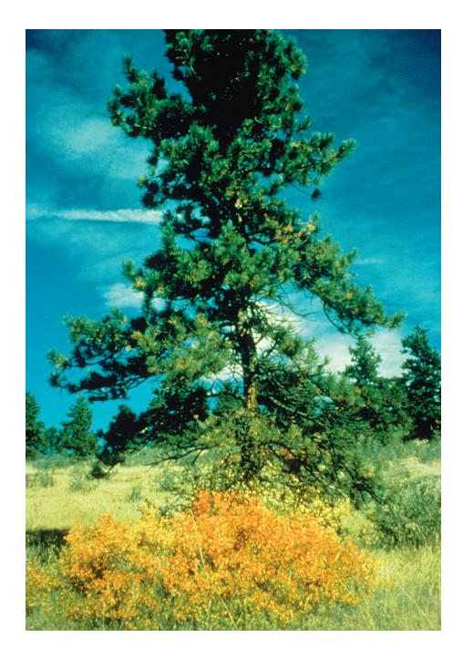
Figure 3: Ponderosa pine (Pinus ponderosa)