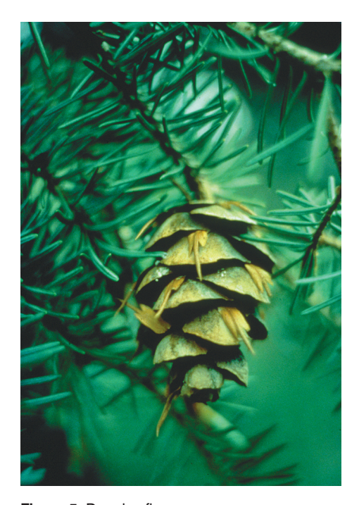
Figure 5: Douglas-fir cone (Pseudotsuga menziesii)

not be sited with plants of dissimilar water needs. Similarly, a Colorado blue spruce should not be planted on a southfacing slope, where a significant amount of additional moisture would be required.