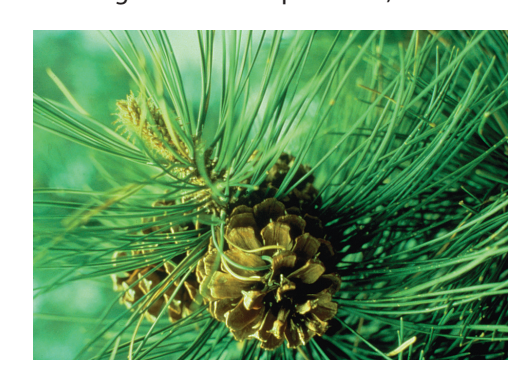
Figure 1: Ponderosa pine cones ( Pinus ponderosa )

There are several factors to consider when designing a native landscape. Due to Colorado's variation of elevation and topography, native plants are found in many habitats. In order to maximize survival with minimal external inputs, trees should be selected to match the site's life zone and the plant's moisture, light, and soil requirements. Even if a plant is listed for a particular life zone, the aspect (north, south, east, or west facing) of the proposed site should match the moisture requirement. For example, a Colorado blue spruce, which has a high moisture requirement, should