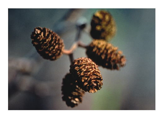
Figure 2: Alder fruit (Alnus tenuifolia)