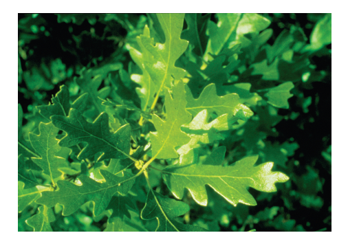
Figure 7: Gambel oak (Quercus gambelii)

requiring medium to high moisture occur along watercourses throughout all zones.