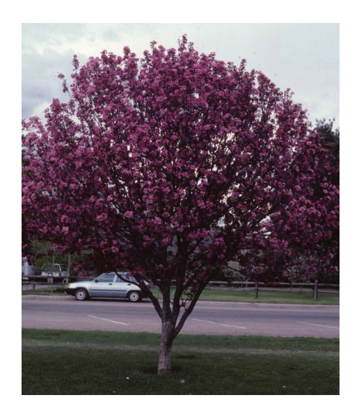
Figure 1: Malus 'Radiant'