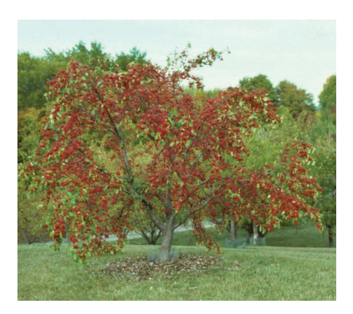
Figure 2: Malus 'David'