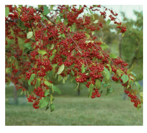
Figure 3: Malus 'David'

inches of annual moisture (precipitation plus any supplemental watering). Planting them in high-maintenance turfgrass generally subjects them to more water and fertilizer than they need, often resulting in more incidence of disease. A better location is in mulched beds,