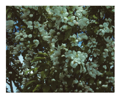
Figure 4: Malus 'Spring Snow'