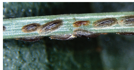
Figure 5: Pinyon-needle scale, “bean stage” nymphs on needles.