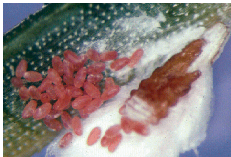
Figure 2: Pine needle scale exposed from cover while laying eggs.

late winter and early spring. Under cooler conditions, initial egg hatch can be delayed until as late as the first week of June. If cooler weather persists all spring, hatching can continue for a month or more.