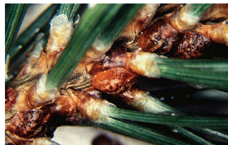
Figure 3: Striped pine scale.

Striped pine scale nymphs are generally orange to brown. Female scales remain on the twigs while males migrate to the needles. Males become enclosed in a papery covering as they mature. They emerge to mate with the females in late summer. There is one generation per year.