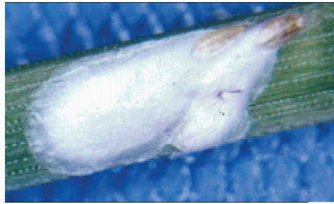
Figure 1: Pine needle scale.

Additionally, egg hatch dates vary with elevation and seasonal temperatures. An early hatch, sometimes beginning in late April, can occur following periods of warm weather in