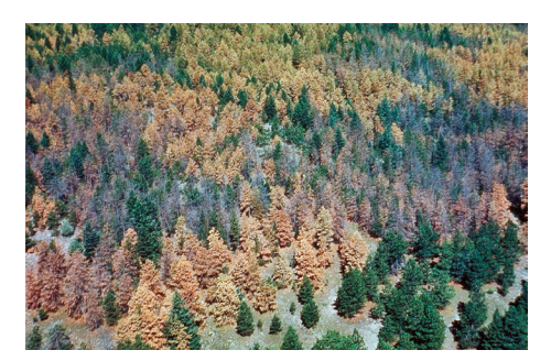
Figure 4: Mountain area infested by MPB, showing three years of mortality. Old, dead trees are gray; newly killed trees are straw yellow or orange. Some trees may also be infested but do not turn color until nine months or so under attack.