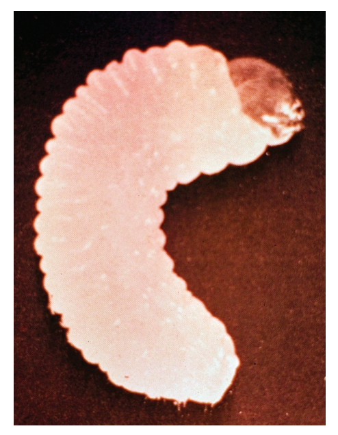
Figure 5: Larva of MPB (actual size, 1/8 to 1/4 inch). They are found under the bark in tunnels.