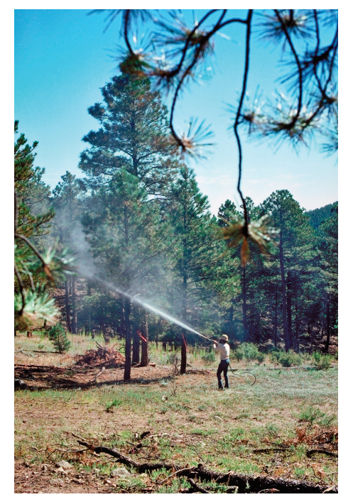
Figure 10: Large, uninfested pine being preventively sprayed. This protects high-value trees and should be done annually between April 1 and July 1.