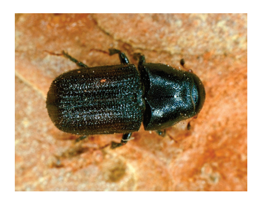
Figure 3: Top view of adult MPB (actual size, 1/8 to 1/3 inch).