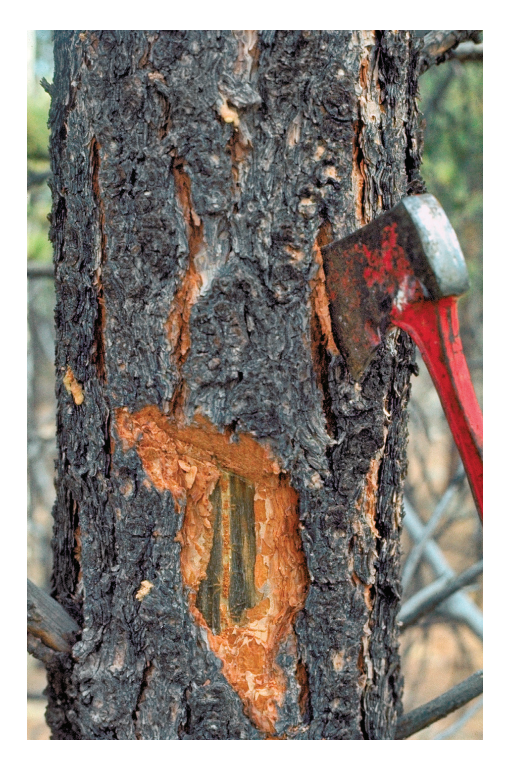
Figure 7: Checking beneath the bark for MPB. This attack was successful (note tunnels and stain).

One very effective way to kill larvae developing under the bark (though very