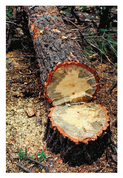
Figure 9: Cut tree killed by MPB, showing the characteristic blue-staining pattern.