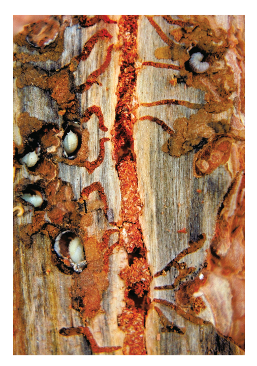
Figure 8: Characteristic tunnels (galleries) of mountain pine beetle made by the adults and larvae. The underbark area looks like this in late spring. Bluestained wood is caused by fungi the beetles introduce.

Misidentification of healthy trees: Under dry conditions, trees may not produce pitch tubes when infested, therefore healthy trees are not as obvious. Time may need to be spent looking for sawdust around a tree's circumference and at the base of the tree.