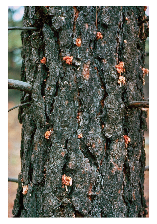
Figure 2: "Pitch tubes" indicating trunk attacks by MPB. Success of the attacks is confirmed by looking under the bark with a hatchet for beetles, their tunnels and/or bluestaining.