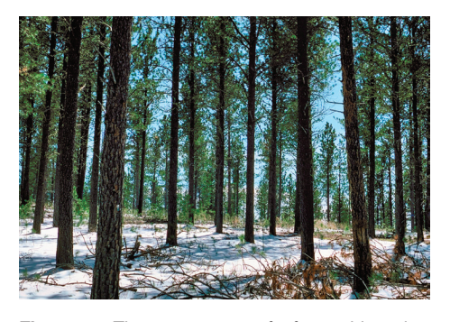
Figure 11: The appearance of a forest thinned to help prevent MPB. This can also improve mountain views and reduce fire hazard.