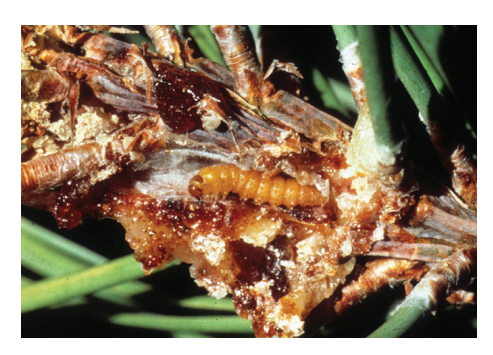
Figure 5: Pinyon tip moth larva exposed in terminal.

cone, which they also mine. Irregular pitch masses often form at the injury site, superficially resembling those of the pinyon pitch nodule moth. Pupation occurs within the infested area, with the adult moths emerging to mate and lay eggs.