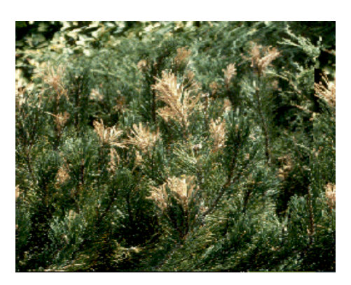
Figure 3: Tip damage from larvae of pinyon pine tip moths.

Figure 2: Southwestern pine tip moth adult, Rhyacionia neomexicana .