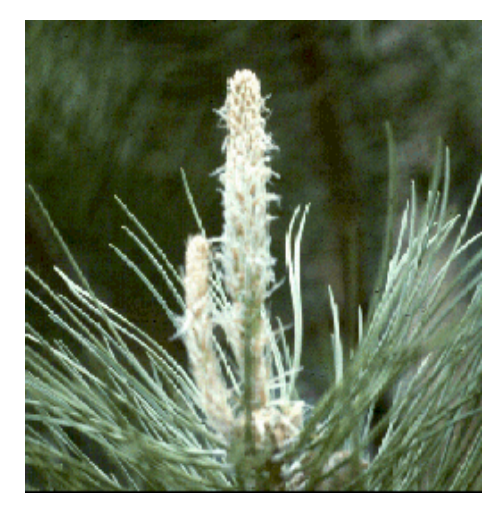
Figure 4: Stage of shoot elongation to apply insecticide treatment for southwestern pine tip moth control.