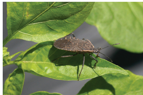
Figure 2: Squash bug.