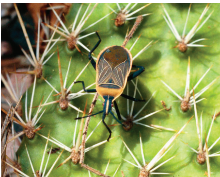
Figure 6: Opuntia bug.

home. Swatting, vacuuming or otherwise disposing of individual insects is the appropriate response.