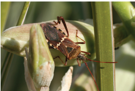
Figure 5: Western leaffooted bug ( Leptoglossus clypealis ), a leaffooted bug common on various fruits and flowers.