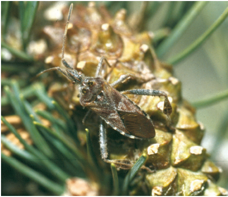
Figure 3: Western conifer seed bug.