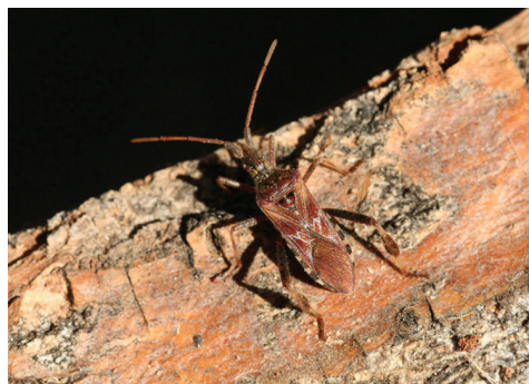
Figure 1: Western conifer seed bug.

There is probably little that will effectively control the occasional nuisance movement of conifer seed bugs into homes. The best action is to ensure that homes are well sealed during September and October, when most insects migrate from trees to buildings and other winter shelter. It is probable that insecticide applications to building exteriors, particularly directed at cracks and openings where the insects may enter, should assist in reducing numbers found indoors. However, insecticides have not been tested against these insects. Do not use insecticides to control insects already in the