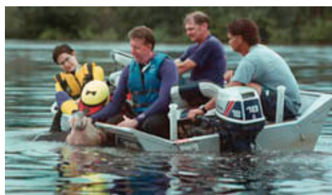
Figure 1: Rescue workers aid a cow caught in flood waters.

A disaster is considered an incident that is beyond the scope where individual, local and community resources can deal with the event as an emergency. This usually indicates the event either happens very rapidly, there is no mitigating control, or both. This is why emergency service responders use the idiom