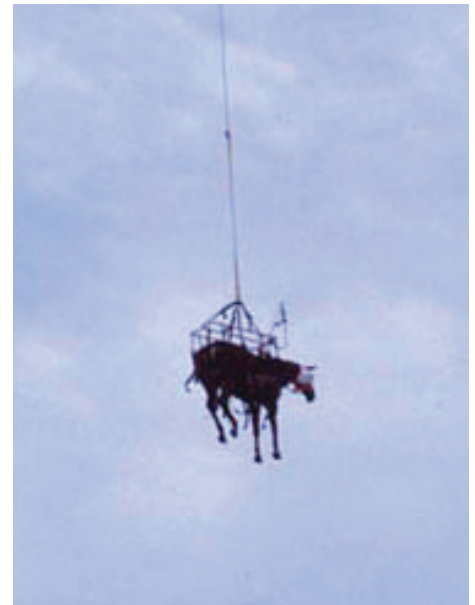
Figure 3: A horse gets airlifted during this rescue.

Livestock will resist being moved from an area with limited protection and usually also resist efforts to move them into the face of a storm. For this reason, plan your management approach as early as possible. Young animals are a special risk since they can get buried in snow more easily and have less physical strength and less resistance to cold exposure. Address the young animals first and the older livestock will often follow from both maternal and herd instinct. Although animals rarely get frantic or panicky during blizzards, they do get determined to avoid the wind, cold and poor footing.