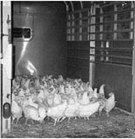
Figure 4: Hens being transported in a horse trailer.

the sides of livestock or others attach identification tags to animals. If you choose to leave a halter on your animal, consider attaching identification—such as a luggage tag.