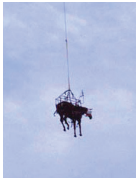
Figure 3: A horse gets airlifted during this rescue.

Livestock will resist being moved from an area with limited protection and usually also resist efforts to move them into the face of a storm. For this reason, plan your management approach as early as possible. Young animals are a special risk since they can get buried in snow more easily and have less physical strength and less resistance to cold exposure. Address the young animals first and the older livestock will often follow from both maternal and herd instinct. Although animals rarely get frantic or panicky during blizzards, they do get determined to avoid the wind, cold and poor footing.