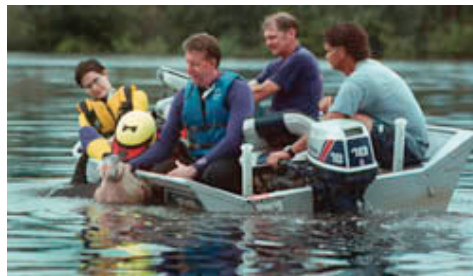
Figure 1: Rescue workers aid a cow caught in flood waters.

“You respond to emergencies—you recover from a disaster.”