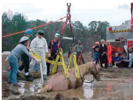
Figure 2: Rescue workers free a horse caught in mud after a storm.

Tornadoes have extreme intensity, wind speeds 2 to 3 times that of a hurricane, but they have a very short duration. Livestock