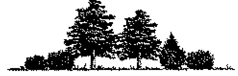
Figure 2: Ladder fuels enable fire to travel from the ground surface into shrubs and then into the tree canopy.