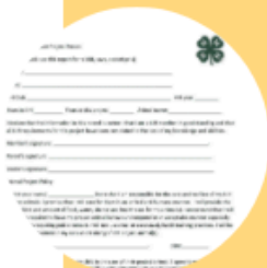
Exhibit requirements include:

Completing an Animal Science Discovery Display Board e-Record.