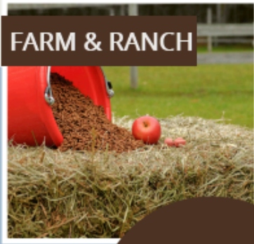
FARM & RANCH

ITEMS Donations accepted ahead of the sale, contact Kathy to arrange a drop- off time.