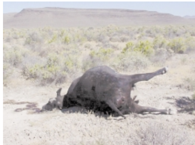
Fig. 2. Anthrax infected cow.

The carcass and all materials associated with the carcass should be destroyed and the ground should be disinfected. This can be difficult. The preferred method of destruction would be incineration of the carcass.