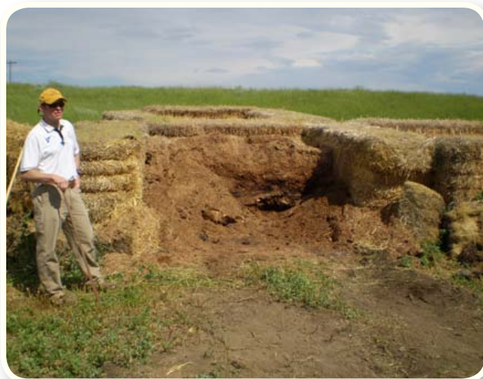
Bones remaining at 3 months, skull on left, spine on right. These will nearly breakdown completely when recovered for 3 more months

Size and volume of mortalities will directly influence the physical footprint of the pile or volume of bin space designed, amount of carbon material required, and the time required to fully compost the carcass(es). Smaller carcasses have more surface area relative to mass; this provides for more carbon material to carcass interaction. Similarly, cutting or breaking apart large carcasses can speed up the composting process, if necessary. While properly constructed and layered poultry mortality compost will process in a matter of a few short weeks, cattle will take months (6-12) under average conditions (in static piles; i.e., no turning).