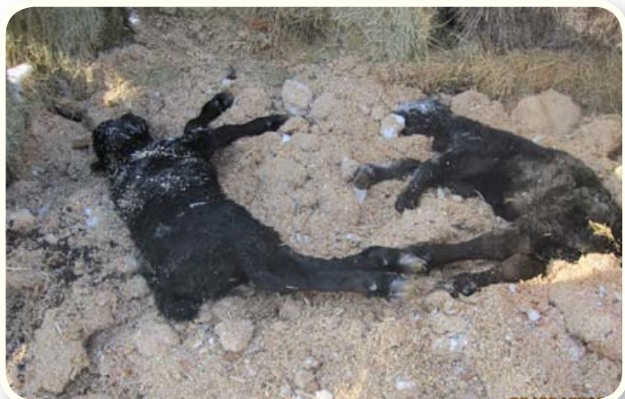
Calves on base, credit: Dafoe

should be covered completely with material on all sides (as described in the next section). The finished pile may reach up to six feet in height, in the example of a large cow. Small carcasses should be layered and arranged to maintain carbon margins around each dead animal. Small carcasses can also be stacked in tiers with carbon layers in between.