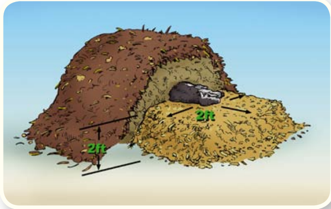
Cow position in pile

of 18-24 inches, as illustrated below. Estimates of total material needed to fully compost a full grown cow are 12 cubic yards, or for 1,000 lbs of carcass, 7.4 cubic yards (200 ft 3 ). The difference in the estimates can be attributed to the thicker base recommended by some experts. Practically speaking, for a mature cow, a proper