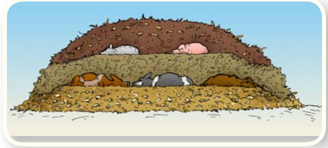
Layered small carcasses

base will be about 9 feet wide by 10 feet long. Once the mortality is placed in the middle of the base, 24 inches of cover in all directions should be attained. Considering side slope, material on top will likely be more than 24 inches above the mortality to achieve the proper margin. When layering smaller carcasses, or parts of carcasses, an 8 to 12 inch margin should be maintained around each carcass. Bins and bunkers can reduce height and foot print of piles.