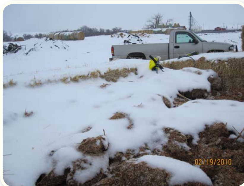
Snow on pile/bin

While much of the northern plains and Rocky Mountains are dry for most of the year, there are periods when moisture can become excessive. Excess moisture is not so much an issue with the piles themselves but with traffic lanes and carbon sources. Carbon sources should be properly stored or covered if precipitation could saturate them. Carbon sources in the previously mentioned 40-60 percent moisture range are very ideal for mortality composting and continue to absorb moisture, preventing leaching. Excessively dry compost piles will actually shed water for a time before they begin to absorb moisture. Snow does not seem to affect the pile and may serve as an insulating blanket during periods of extreme cold. Bad weather, of course, can increase mortality and base piles should be constructed ahead of time in expectation of weather-related deaths.