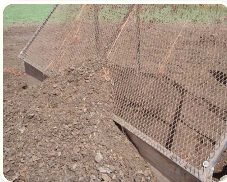
Home-made screen

A screen is also helpful in improving final product quality, especially if the compost will be land applied. A screen allows for the separation of compost fines from residual bones and other trash such as baling twine, ear tags or other material. The simplest screen, ideal to have near the mortality compost site, is a frame of angle iron with an expanded metal face. The face should be angled at 45 degrees or more, and elevated one to five feet off of grade with the top of the screen appropriate to the reach of the loader being used. The width should also be relative to the width of the bucket on the operation's loader. For example, screen area should be five to six feet wide by six to eight feet long, angled and elevated as previously described. More discussion of bones and screening is found in the Issues section of this document.