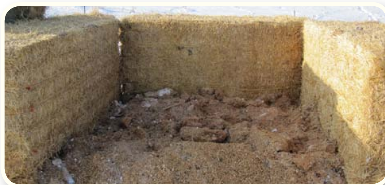
Bin and base