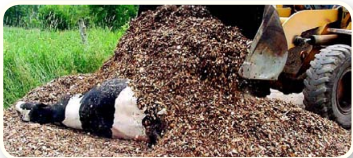
Cows on base