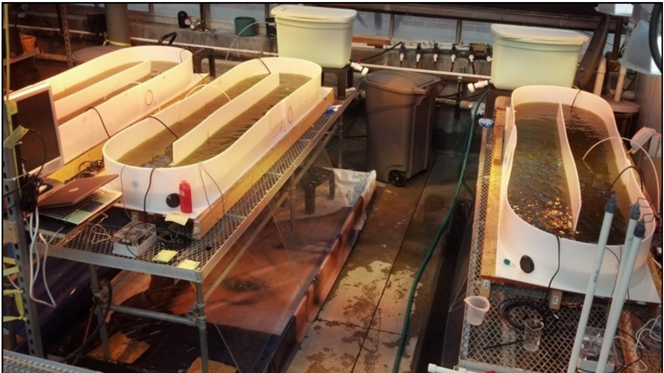
Figure 3. Algal production raceways (Feris Lab, Boise State University).