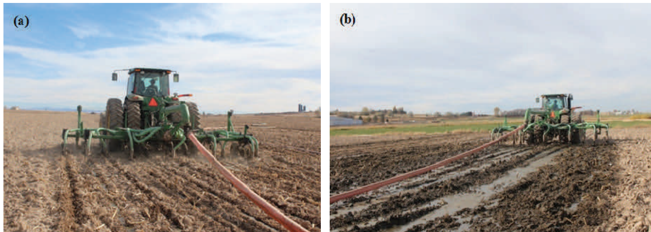
Figure 1. Manure application method with drag hoses: a) subsurface injection and b) surface broadcast.

For each test site, a grab sample (about 1 L) of liquid manure was collected and analyzed. The manure pH, total N, and calculated total N application rates are shown in Table 1. The liquid manure application rate on both test sites was approximately 20,000 gal/acre. Continued on page 6