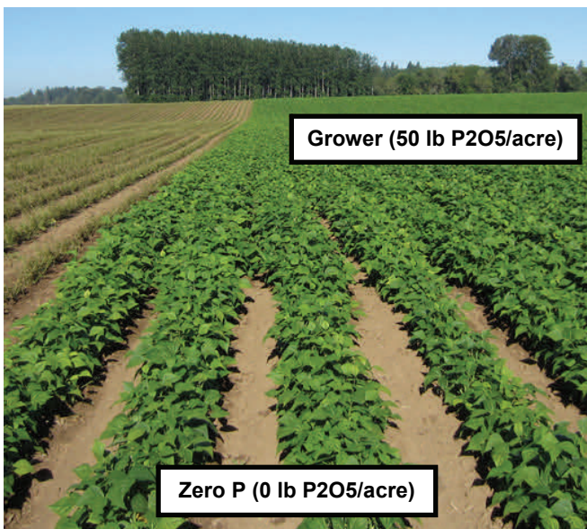
Figure 1. Response of snap beans to P fertilization in field #2 with a low value for soil test P (34 ppm via Bray P1 method). Beans responded to P fertilizer only in fields where soil test P was less than 55 ppm. Only 2 fields out of 7 grower fields monitored had soil test P < 55 ppm.