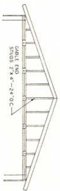
GABLE END FRAMING

MENTION OF A TRADE NAME DOES NOT CONSTITUTE A GUARANTEE OR WARRANTY OF THE PRODUCT BY THE U. S. DEPARTMENT OF AGRICULTURE OR AN ENCOURAGEMENT BY THE DEPARTMENT TO USE OTHER PRODUCTS NOT MENTIONED.