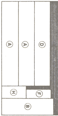
3/4" x 4'-0" x 8'-0" EXTERIOR A-C