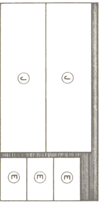
3/4" x 4'-0" x 8'-0" EXTERIOR A-C

NOTE: USE EXTERIOR A-C PLYWOOD GLUE AND NAIL ALL CABINET JOINTS