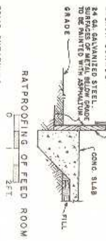
RATPROOFING OF FEED ROOM