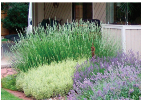
Figure 4: The tall white lavandin in the background is 'White Grosso'. In front of it are the English varieties 'Goldberg' and 'Mitcham Grey'.