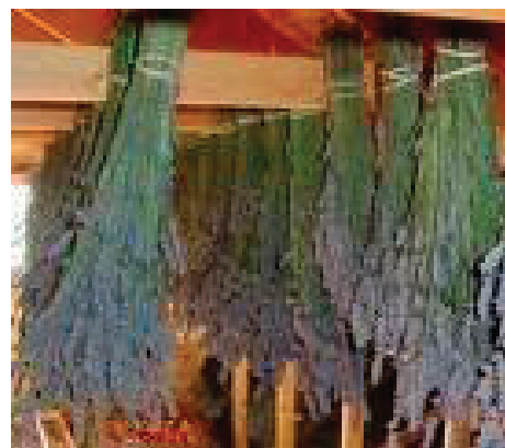
Figure 6: