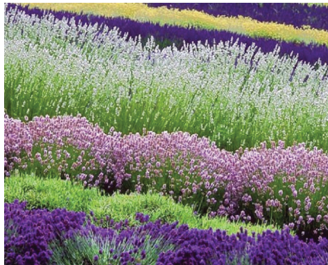
Figure 2: Various colors of Lavender.

to both types of lavenders. Note that French and Spanish lavenders are not cold hardy in Colorado but can be used as annuals in containers and outdoor beds.