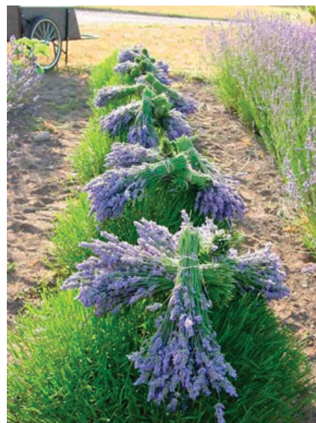
Figure 5: Photo courtesy of Lavender Wind Farm.

Use a sickle or pruning shears to cut stems as long as possible. Form bundles of 50 to 100 stems and secure them with rubber bands (Figure 5). Rubber bands will contract when the stems dry out. Dry the harvested lavender in a cool, dark place where there is good air circulation (Figure 6).