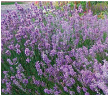
Figure 3: Lavandin 'Provence'.