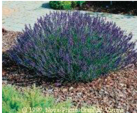
Figure 1: Lavandula angustifolia 'Hidcote'.

Two types of lavenders grow well in Colorado. The first is Lavandula angustifolia or English lavender. It is hardy to Zone 5 and often blooms twice in one season. There are hundreds of varieties of English lavender available depending on the color and size of plant desired. The second is a hybrid of L. angustifolia and L. latifolia . It is commonly referred to as a lavandin. Lavandins are generally larger plants that bloom only once later in the summer and produce sterile seed. The Lavandins produce larger quantities of essential oil but not as high quality as the English lavenders. Both types of lavenders have a place in landscapes and as a cash crop. In this fact sheet, the word lavender will refer