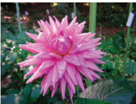
Figure 3: Pink dahlia with water drops.

After the vegetation is killed by frost, prune back the stalks to 6 inches. Leave the tuberous roots in the ground for two weeks to harden before digging them. Dig carefully so the tuberous roots do not break away from the clump. If the clump separates, there is a risk of 'blind roots', tuberous those that do not produce a shoot because there is not vegetative 'eyes'. Dry the tuberous roots enough to shake off excess soil, and pack in sawdust, perlite or vermiculite and store in a cool, dry place until spring.