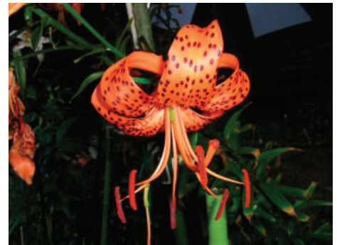
Figure 5: Tiger lily.

Allium is a member of the onion family, but these plants are very ornamental and showy. Plants vary in height, and flowers can range from two to ten inches in diameter. Dwarf species thrive in rock gardens, and taller species enhance larger gardens. Allium flowers are ball-shaped and consist of many tiny florets in hues of white, yellow and blue. These bulbs make great cut flowers that last for a long period of time; flower heads can also be left to dry on the plant and later cut for dried arrangements. While alliums do not need to be dug from the ground after frost, be sure to mulch the bulbs well to ensure winter survival.