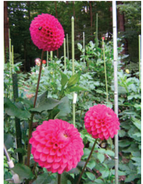
Figure 4: Three-ball form dahlias.

Tuberous begonias range in color from white, yellow and orange to deep red. Flowers are usually double and bloom for a long period. Plant the tuberous begonia roots (which may be up to 1 ½ inches in diameter) 4 inches deep in a partially-shaded area. Tuberous begonias do best in soil with high organic matter that is kept relatively moist. After frost, dig the roots from the ground, pack in sawdust, and store under cool, but frost-free conditions for replanting in the spring.