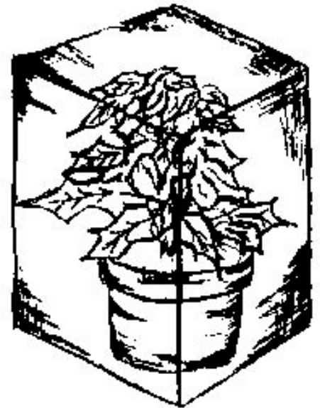
Figure 2: Use a wastebasket or opaque box to keep the plant in darkness for 14 hours a day. Start October 1 and continue until color shows in top bracts.

each gallon of soil mix. Apply a slow release fertilizer to the soil surface.