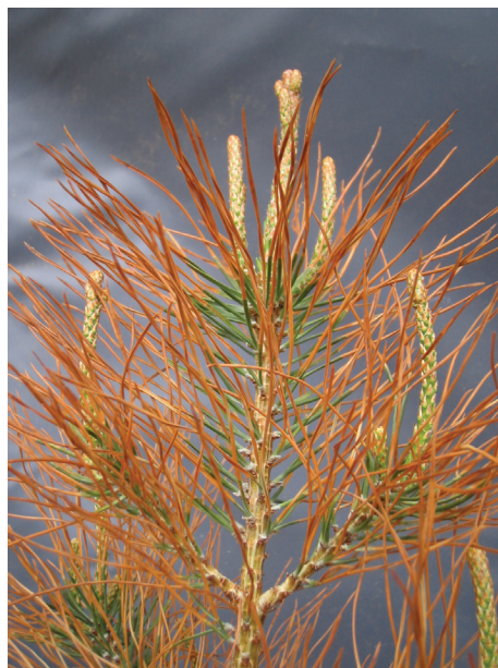
Figure 2: Tip burn on conifer foliage. Low severity of tip burn (left). High severity of tip burn (right).

with water stress. Follow the diagnosis questions below and collect foliar samples to determine chloride content.