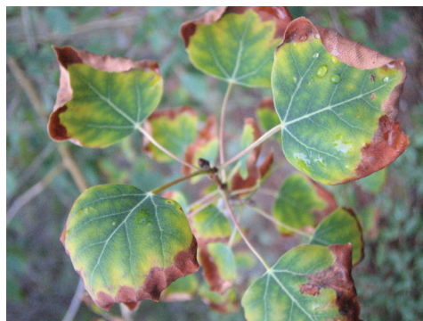
Figure 1: Marginal burn on roadside aspen leaves.

Chloride toxicity in woody plants initially develops as a marginal necrosis on deciduous leaves (Figure 1) or a tip burn or necrosis on conifer needles (Figure 2). Generally, the higher the foliar chloride concentrations, the more extensive the necrosis becomes. In prolonged exposures, necrosis moves