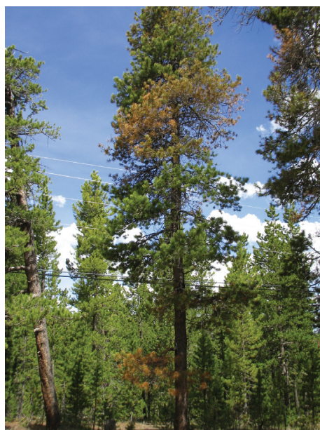
Figure 3: Necrotic foliage "spiral" on roadside lodgepole pine crown.

If the road is or has been treated with MgCl_2 products, it may have washed into surrounding soils. A splash and aerosol zone also occurs along treated paved roads and contributes to foliar accumulation of MgCl_2 . At very high soil concentrations, MgCl_2 damage may appear on trees after two years of treatment.