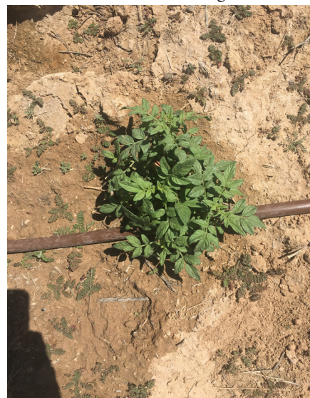
Some gardeners use drip irrigation systems, which slowly deliver water to the base of each plant.

Potatoes require consistent soil moisture. Variability such as infrequent or too heavy watering can cause growth cracks, irregular shapes, and hollow heart. Gardeners should determine the appropriate frequency and duration of watering based on the weather, soil type, and water needs of other plants in their garden. Potatoes typically require about two inches of water per week. A rain gauge placed at ground level near the potato plants will indicate how many inches of water the plants receive. The period of highest water need is in late June to early August when the potato foliage is fully developed. This is usually when the plant flowers and the leaves are dark green. As the plants begin to turn yellow and mature in the later summer, gardeners can