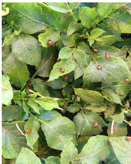
Gardeners may observe beneficial ladybugs on their potato plants.