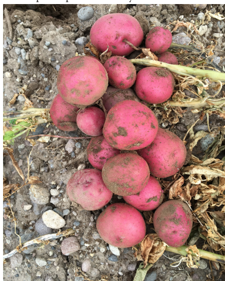
These potatoes are newly harvested.