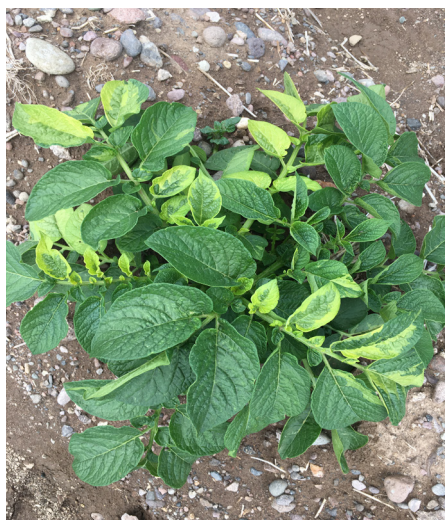
Gardeners should monitor their plants for unusual changes, such as this leaf color, which may indicate a disease.

Weeds should be identified and removed frequently, as they can act as hosts of potato disease and compete for water and nutrients. Weed control is especially important while the potato plants are less than a foot tall and fast growing weeds can outcompete the young potatoes. Most weeds thrive on disturbance to the soil and can even grow from fragmented root pieces, so it is best to pull them out by as much of the root as possible instead of cultivating them into the soil with a hoe or rake. This also prevents tuber and potato root damage.