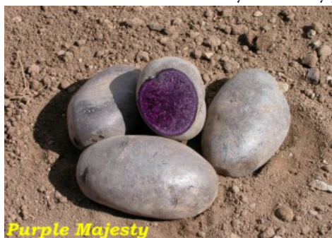
Purple majesty potatoes were developed by Colorado State University.

*Yukon Gold is not a CSU variety, but is very popular with home gardeners