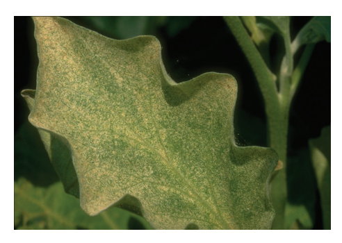
Figure 3: Twospotted spider mite injury to eggplant.

Various insects and predatory mites feed on spider mites and provide a high level of natural control. One group of small, dark-colored lady beetles known as the "spider mite destroyers" ( Stethorus species) are specialized predators of spider mites. Minute pirate bugs, big-eyed bugs ( Geocoris species) and predatory thrips can be important natural enemies.