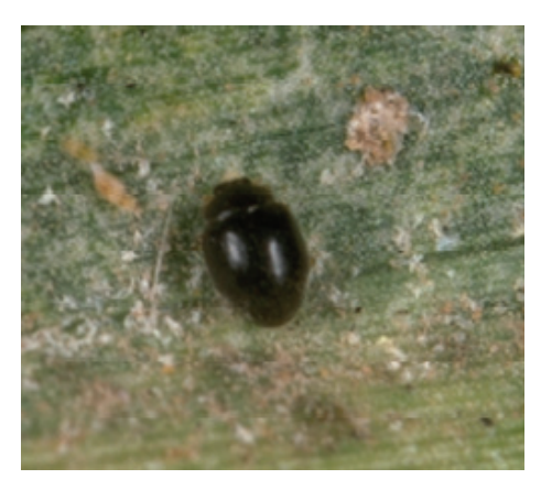
Figure 4: "Spider mite destroyer" lady beetle.