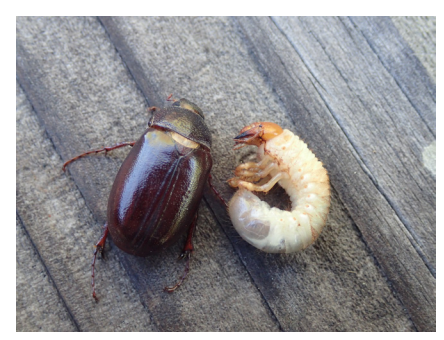
Figure 9: Adult and larva of a May/June beetle.