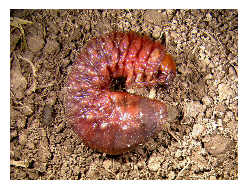
Figure 14: White grubs killed by Heterorhabditis nematodes turn a reddish brown color.

species used for white grub control. Nematodes in the genus Steinernema , such as Steinernema carpocapsae , are not effective for control of white grubs.