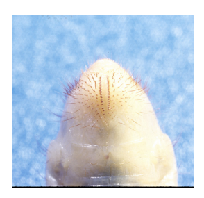
Figure 12b: Rastral pattern of a May/June beetle grub.