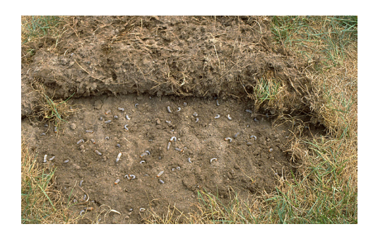
Figure 3: Damaged sod pulled back to expose white grub larvae. Photo by David Shetlar, The Ohio State University.

Figure 2: White grub in root zone of a lawn. Photo by David Shetlar, The Ohio State University.