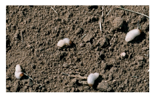
Figure 18: Late stage billbug larvae feed on the roots.

sod. Billbug injury appears as wilting and occasional death of grass, often in small scattered patches. Extensive areas of a lawn may be killed during severe infestations.