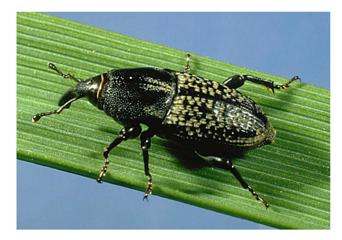
Figure 20: Adult of the Rocky Mountain billbug.

(Sphenophorus cicastristriatus), also known as the "Denver billbug", is far more common throughout Colorado. The life cycle of this insect is more complicated than the bluegrass billbug. Some of the insects overwinter as adults, but most remain in the larval stage and feed