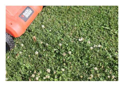
Figure 13: If flowering weeds are present lawns should be mowed before application of insecticides to reduce risks to pollinators.

Insecticides applied to lawn areas can be a hazard to pollinating insects if there are dandelions, clovers or flowering plants mixed with the turfgrasses in the treated area. To reduce this risk lawns should be mowed to remove all blooms before applying the insecticides.