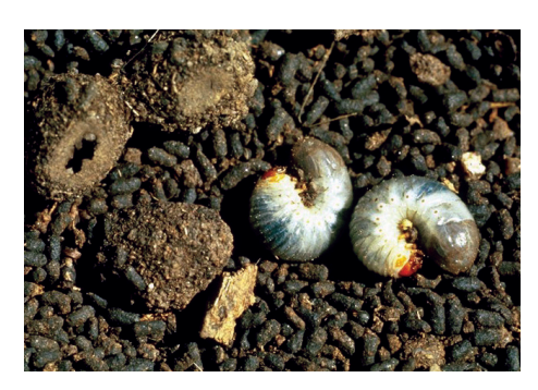
Figure 5: Most white grubs in Colorado do not damage plants. These are larvae of the bumble flower beetle, which develop in compost and animal manure.

Most May and June beetles have a threeyear life cycle (Figure 10). Adult beetles emerge during May and June and lay eggs in the soil. Grubs feed during the summer