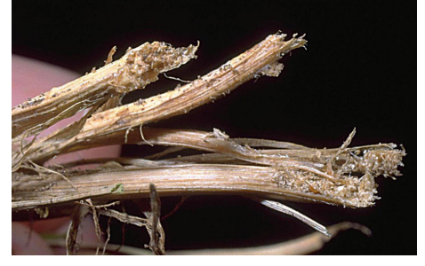
Figure 17: Grass plants damaged by billbugs will often break at the crown when pulled, exposing chewed areas of the stem.