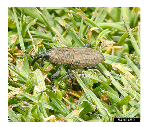
Figure 19: Adult of the bluegrass billbug.

sod. Billbug injury appears as wilting and occasional death of grass, often in small scattered patches. Extensive areas of a lawn may be killed during severe infestations.