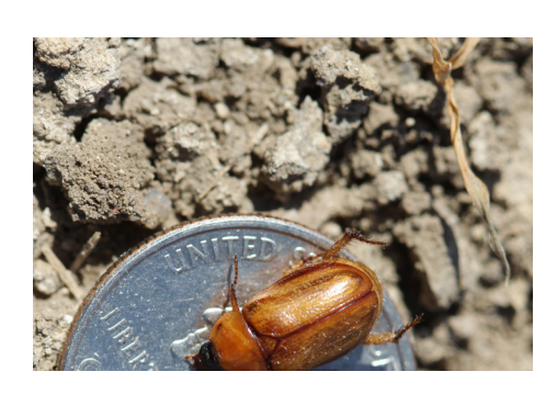
Figure 8: Adults of the southwestern masked chafer.