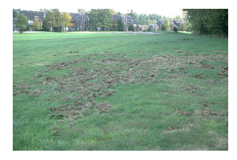
Figure 4: Damage to turfgrass caused by skunks or raccoons digging for white grubs.