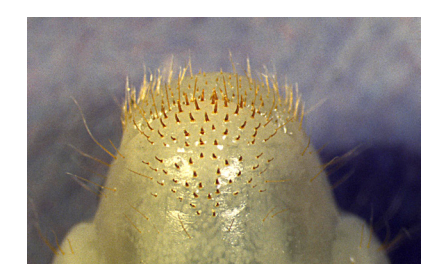
Figure 12a: Rastral pattern of a masked chafer grub.

Identifying different types of white grubs. All of the different kinds of white grubs found in lawns have a generally similar appearance. However, on close examination they can be distinguished by looking at the pattern of hairs and folds on the hind end of the abdomen. This is known as the rastral pattern. A comparison of the rastral patterns of a masked chafer, May/June beetle, and the Japanese beetle are illustrated in Figure 12.