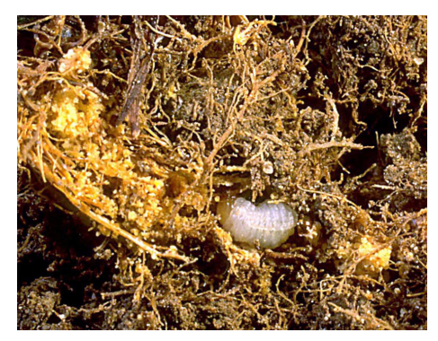
Figure 16: Billbug larva feeding within the base of a grass plant.

Billbug injury is most common on new lawns, particularly those established with