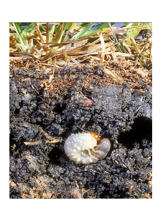
Figure 2: White grub in root zone of a lawn.

*Colorado State University Extension entomologist and professor, bioagricultural sciences and pest management. 1/19.