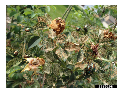
Figure 11: Japanese beetle adults feeding on rose leaves and flowers.

Japanese beetles begin to lay eggs in mid to late June. Egg laying is largely concluded by late July although some continues through late summer. Peak damage to turfgrass occurs in late summer. Larvae that feed on lawns in spring do little injury and the actively growing plants at this time of year are well able to recover from root feeding grubs.