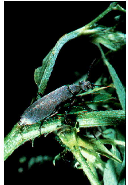
Figure 2: E. fabricii , a blister beetle common in June in Colorado.

Insecticides are hazardous to pollinators, especially honey bees. Read, understand and follow all label directions, including pollinator protection statements.