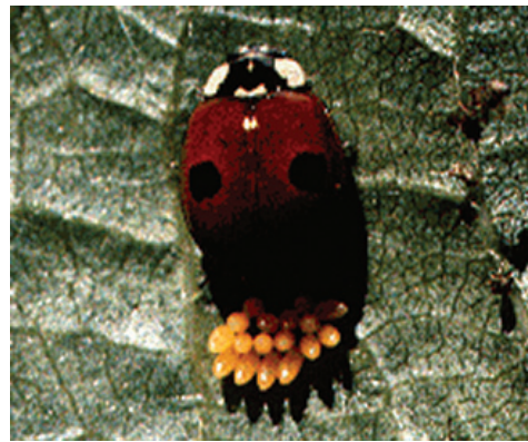
Figure 1: Twospotted lady beetle laying eggs.

One species of lady beetle, however, the Mexican bean beetle, is a plant pest. This