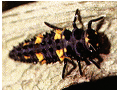
Figure 2: Typical lady beetle larva.

common Colorado insect is found feeding on bean leaves. It is distinguished from other lady beetles by spotting and color in the adult stage. Larvae of the Mexican bean beetle are yellow and spiny.