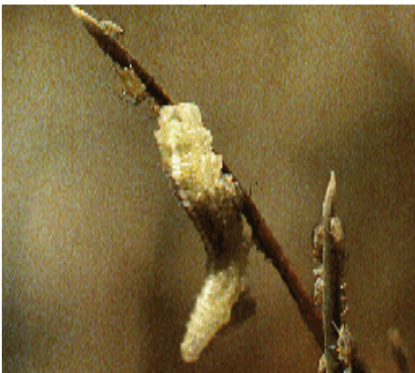
Figure 6: Syrphid fly larva.

lions, are voracious predators capable of feeding on small caterpillars and beetles, as well as aphids and other insects. In general shape and size, lacewing larvae are superficially predators capable of feeding on small caterpillars and beetles, as well as aphids and other insects. In general shape and size, lacewing larvae are superficially similar to lady beetle larvae. However, immature lacewings usually are light brown and have a large pair of hooked jaws sticking out from the front of the head (Figure 4).