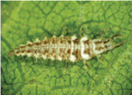
Figure 4: Green lacewing nymph.