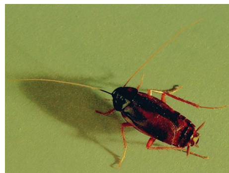
Figure 5: Oriental cockroach.