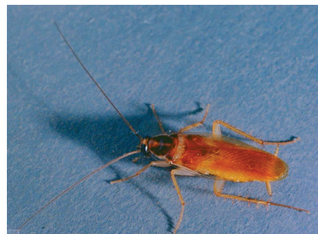
Figure 4: Brown-banded cockroach.