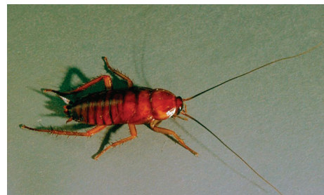
Figure 3: American cockroach.

Detection is an important element of cockroach control. Cockroaches tend to concentrate in certain areas. Controls are more effective if they are targeted at these spots. Cockroach traps, small, open-ended boxes, contain an attractant and sticky substance that retains the insects once they enter. Use them to locate infestations and to determine when populations require additional treatment. Traps can be effective in catching the occasional invader, but they will not eliminate established colonies. Traps are most effective when placed against walls under sinks, in cabinets and in basement corners. If two nights pass without a capture, move the trap to another likely area.