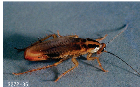
Figure 2: German cockroach.

smaller species, 1/2 inch when full grown, it is light brown with a pair of parallel brown bars between the head and the front of the wings (Figure 2). This species usually is associated with buildings where food is prepared or stored. It commonly migrates from infested areas into nearby dwellings or may be carried in on food containers. Favorite home habitats are warm, moist areas, such as kitchen sinks and appliances, bathroom sinks, and furnaces.