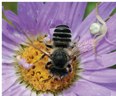
Figure 1: Leafcutter bee (and crab spider) visiting flower.

There also are concerns about leafcutter bee nesting in rose canes, excavating the