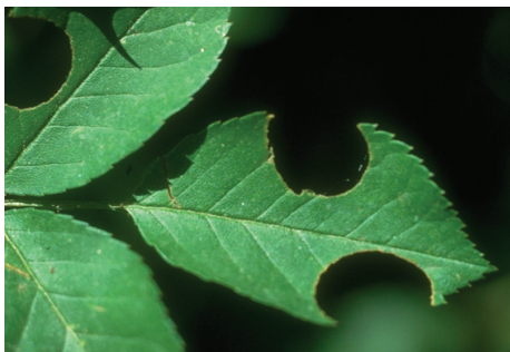
Figure 2: Leafcutter bee injury.