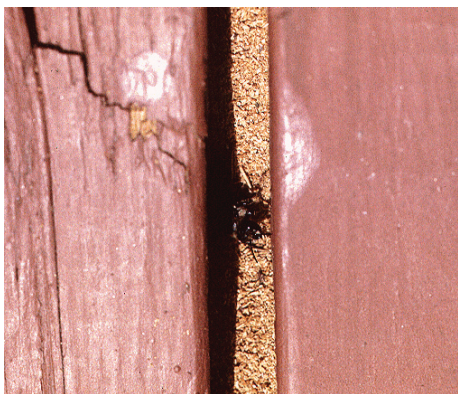
Figure 3: Leafcutter bee nesting on porch, with sawdust.

of closely packed cells are produced in sequence. A finished nest tunnel may contain a dozen or more cells forming a tube 4 to 8 inches long. The young bees develop and remain within the cells, emerging the next season.