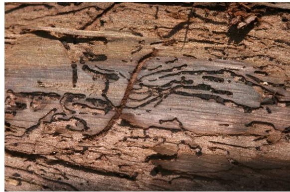
Figure 7. Walnut twig beetle tunneling under bark of large branch.

Adults emerge to produce a second generation. Peak flight activity of adults occurs from mid-July through late August and declines by early fall as the beetles enter hibernation sites. A small number of beetles produced from eggs laid late in the season may not complete development until November.