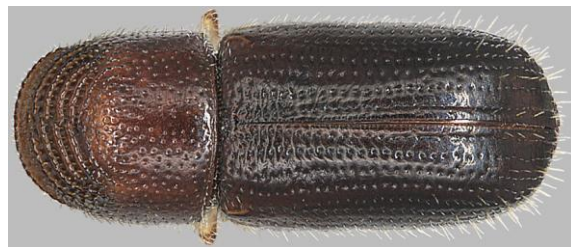
Figure 5. Walnut twig beetle, top view.