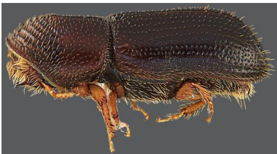
Figure 4. Walnut twig beetle, side view.

Description. The walnut twig beetle Pityophthorus juglandis is a minute (1.5-1.9 mm) yellowish-brown bark beetle, about 3X long as it is wide. It is the only Pityophthorus species associated with Juglans but can be readily distinguished from other members of the genus by several physical features (Figures 4, 5). Among these are 4 to 6 concentric rows of asperities on the prothorax, usually broken and overlapping at the median line. The declivity at the end of the wing covers is steep, very shallowly bisulcate, and at the apex it is generally flattened with small granules.