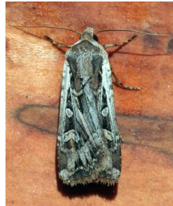
Two army cutworms (“miller moths”) showing range of patterning.

The moth of the army cutworm is typical of the size of many other cutworms found in the state with a wing span of 1.5-2 inches. It is generally gray or light brown with wavy dark and light markings on the wings. The wing patterns of the moths are quite variable in color and markings, but all have a distinctive kidney-shaped marking on the forewing.