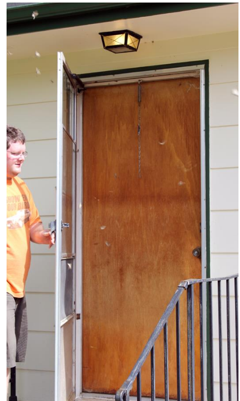
Miller moths often aggregate in the crevices around doors.

Miller moths also may be fed upon by other wildlife as well. For example, they can be an important part of the diet of grizzly bears in the Yellowstone area, which feed on large numbers of the fat-rich moths that rest in large groups under loose rocks.