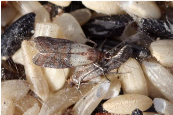
Indian meal moths

Although the army cutworm moth usually is the most common moth in eastern Colorado homes during the time of spring migrations, other moths are more common during other times of year. The Indian meal moth is the most important moth found in homes since its caterpillar stage can be a serious pest of pantry items such as nuts, dried fruit, grains, pet foods, and seeds.