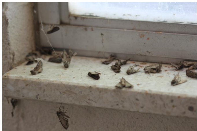
Aggregations of dead moths on windowsills and behind walls.

(It should be noted that some people are very discomforted by the presence of moths in a home. In extreme cases this may develop into a phobia ( mottophobia ) that can lead to