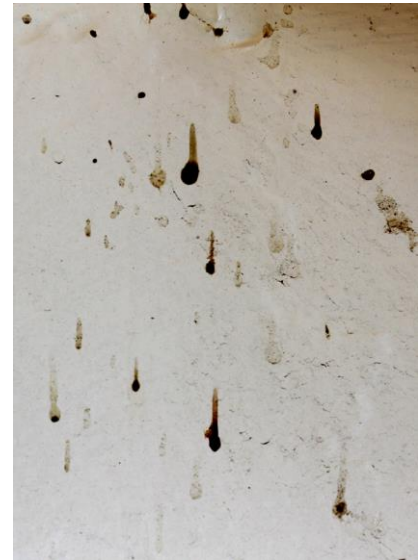
Spotting on walls produced by the meconium of army cutworm moths.

Miller moth spotting is usually not difficult to remove. Follow normal fabric care instructions on clothing. Spray and wash household cleaners can remove the spots from finished walls and most other surfaces. However, cleaning can be considerably more difficult when the spots have set on more porous surfaces, such as unfinished wood.