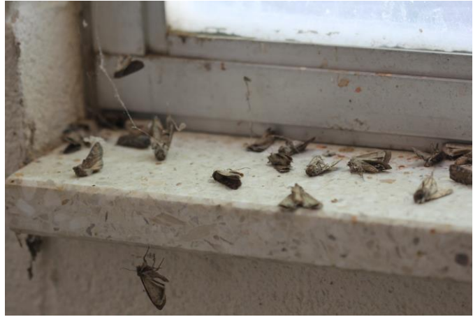
Aggregations of dead miller moths collect around windows and behind walls.

(It should be noted that some people are very discomforted by the presence of moths in a home. In extreme cases this may develop into a phobia ( mottephobia ) that can lead to disruptions in sleep, agitation, and other conditions that can interfere with normal functioning.)