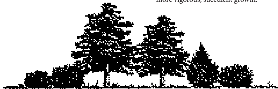
Figure 2: Ladder fuels enable fire to travel from the ground surface into shrubs and then into the tree canopy.