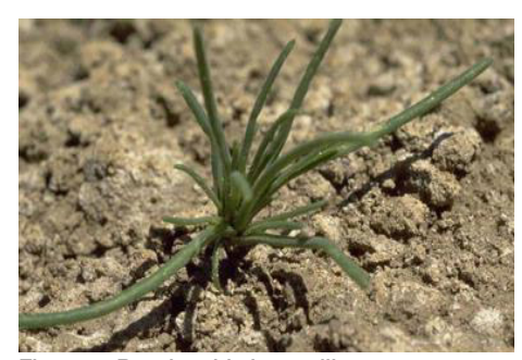
Figure 1. Russian thistle seedling.