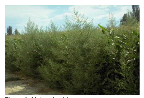
Figure 3. Mature kochia.