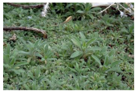
Figure 2. Kochia seedlings.