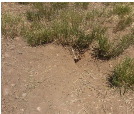
Figure 3: A newly formed Wyoming ground squirrel mound. Note the fanning similar to pocket gopher holes. Wyoming ground squirrel holes remain open.