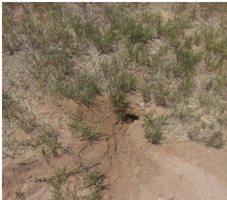
Figure 2: Wyoming ground squirrel burrow has a fanned out low mound. The hole entrance is at an angle and remains open. Usually ground squirrel burrows have several entrances.

Predators of the Wyoming ground squirrels include bullsnakes, rattlesnakes, coyotes, foxes, badgers, weasels, bobcats and raptors.