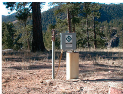
Figure 1: Rural domestic well in the foothills.

Ground water is found in formations called aquifers that occur throughout the state. An aquifer is a geologic formation made up of porous material such as sand, gravel, and unconsolidated rocks. It may also consist of spaces or fractures between subterranean rocks that are saturated with water. Aquifers may be as shallow as a few feet, or as deep as thousands of feet below the ground surface. Wells in mountainous areas of the Front Range typically average 350 feet deep; while in eastern Colorado they range from 40 to 1000 feet deep. Ground water originates as precipitation that moves downward from the earth’s surface until it reaches the water-saturated zone and becomes ground water. Aquifers may spread hundreds of miles or may be in small, localized areas. Alluvial or tributary ground water moves through the aquifer, where it eventually joins a surface stream. Other aquifers are classified as