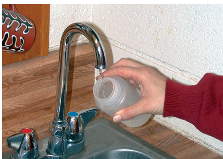
Figure 2: Sampling at the tap for bacteria in well water.