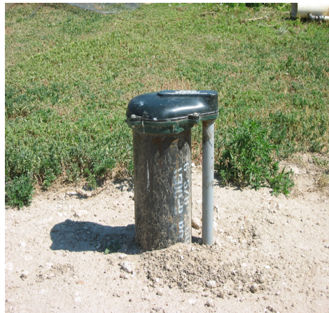
Figure 1: A properly cased and sealed well protects water quality.