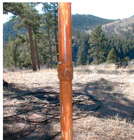
Figure 3: Iron bacterial slime on metal pipe joints.

After the chlorine is poured into the well, pour about 50 gallons of clean water into the same access hole so the metal parts are washed off to prevent corrosion. Wash tools and exposed skin parts, such as arms and face. Allow the chlorine solution to remain undisturbed for two to four hours. Start the pump and surge the well briskly by pumping the water up to the discharge pipe, shutting down the power unit, and allowing the water to fall back into the well. Surge the well in this manner three to four times at 4- to 6-hour intervals. After 18 to 24 hours, the water in the well can be purged.