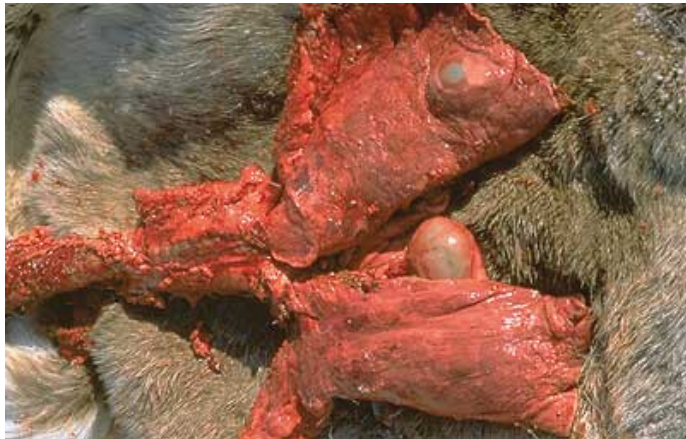
Tapeworm cysts in moose lung.

Definitive hosts support adult tapeworms. Domestic dogs and wild canines (e.g., coyotes, foxes, and wolves) are definitive hosts. Intermediate hosts support the immature (cyst) form of the tapeworm. Several species can be intermediate hosts, including small mammals (e.g., rodents) and ungulates (hoofed animals), including both wild ungulates (e.g., deer, elk, moose) and domestic livestock (e.g., sheep, pigs etc.). 8,9