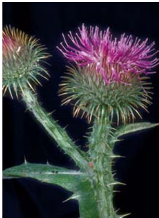
Year 2: Scotch thistle flowers and produces seed