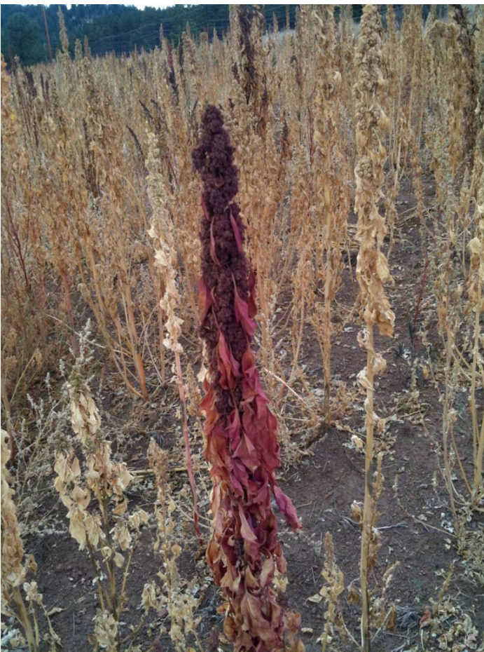
Quinoa ready to harvest

Colorado's high altitude, cool weather, and minimal precipitation, make some areas very suitable for growing quinoa. To set seed, quinoa requires short day lengths and yields best when maximum temperatures do not exceed 90° F. with cool nighttime temperatures. When temperatures exceed 95° F, plants go dormant and pollen becomes sterile. Areas of Colorado between 7,000 and 10,000 feet match the