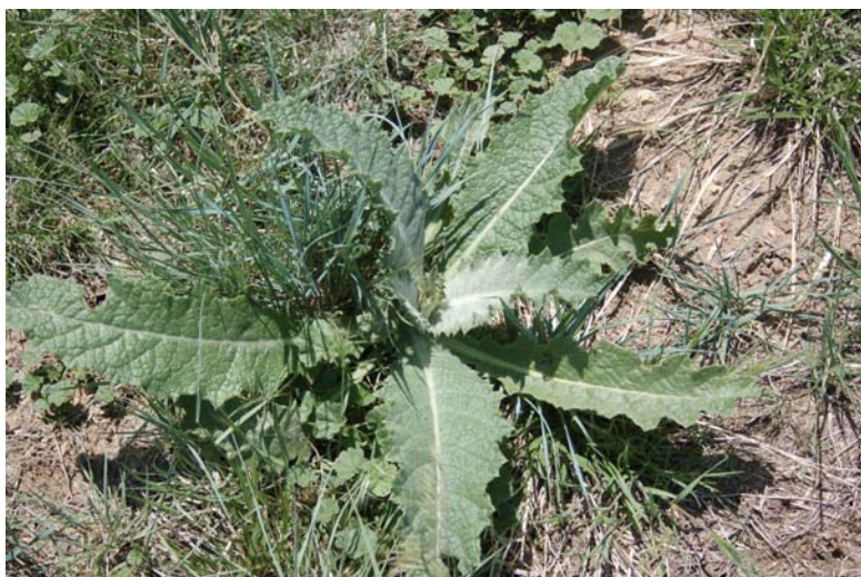
Year 1: Scotch thistle in rosette stage

Due to the robust, spiny nature of Scotch thistle, this plant can act as a living barbed wire fence, making areas impassible for wildlife, livestock, and people. It is a competitive weed in improved pastures where it favors soils with high levels of nitrogen. Scotch thistle is avoided by stock because of its dense spines and this encourages its spread in heavily grazed pastures. If eaten, the spines can cause damage to stock, particularly around the mouth. Spines and dead leaves contribute to vegetable fault in wool. Scotch thistle invades rangeland, over-grazed pastures, roadsides, and irrigation ditches. It also prefers moist areas adjacent to creeks and rivers.