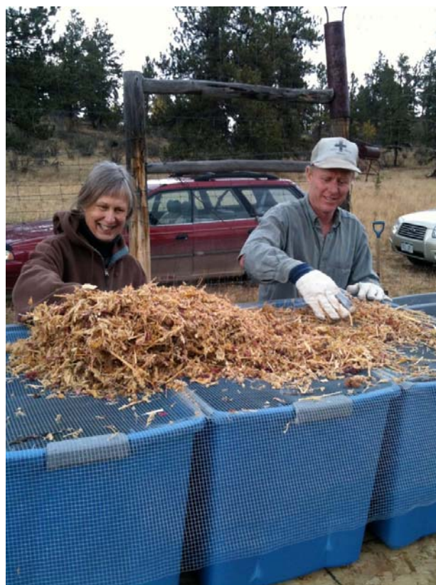
After harvesting quinoa, debris can be cleaned from seeds using a screen.

http://gallery.me.com/tleewilloughby#100514