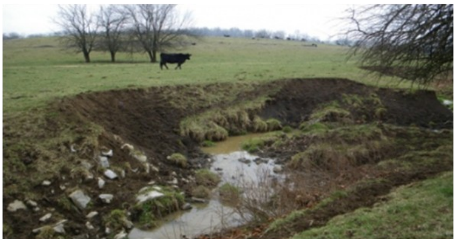
Streambank erosion caused by unmanaged livestock access to the stream.