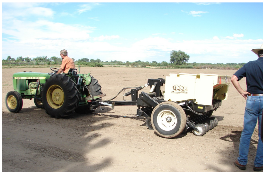
The best method for grass seeding is to use a grass drill.

Many people feel that fertilization when planting grass will improve the chances of grass establishment, but this is not necessarily true. Adding phosphorus can be beneficial, but grasses are not able to benefit greatly from nitrogen. In fact, weed species become much more vigorous when nitrogen supplies are high. This is actually detrimental to the emerging seedlings as they must now compete with the weeds for establishment. If you think your soils are nutrient poor, especially in areas where extensive earth moving has taken place, then it is always a good idea to have your soils tested prior to planting.