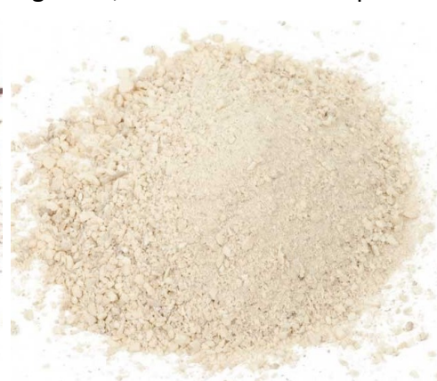
Bone meal (right)