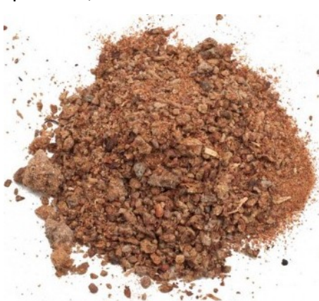
Cottonseed meal (left)