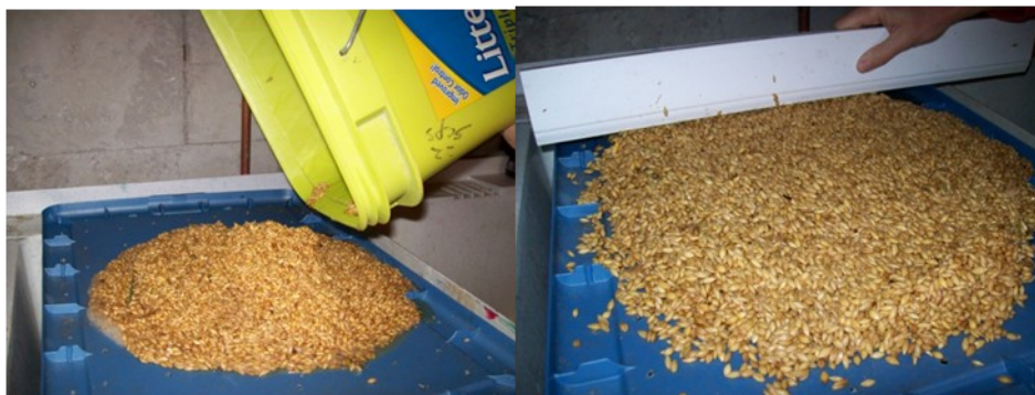
Dump out the seed onto the lid and spread them out with something flat.