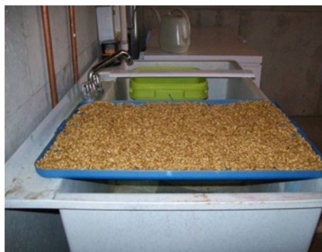
Now it's nice and evenly spread.

Feed Composition for Cattle and Sheep , CSU Fact sheet no.1.615 www.ext.colostate.edu/pubs/livestk/01615.html