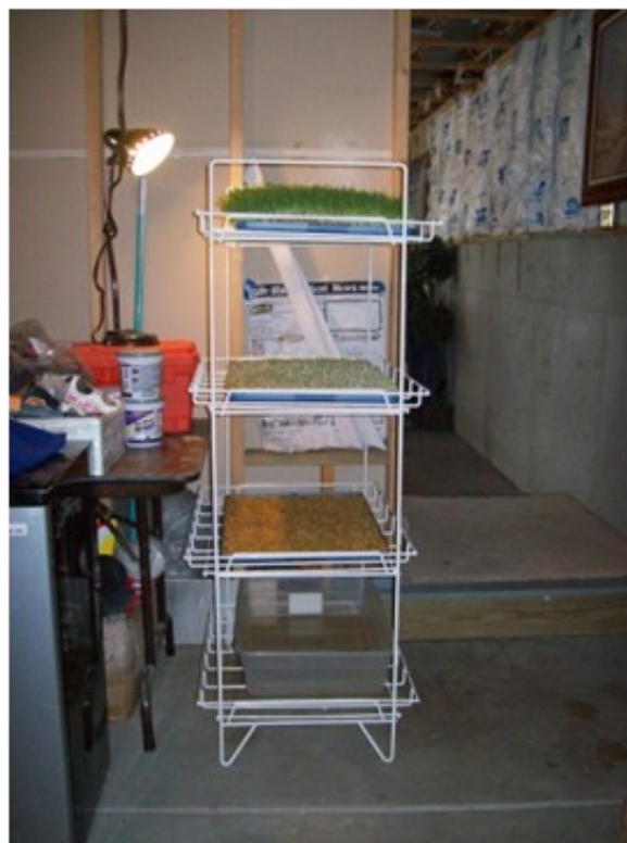
Put the new seed on the rack and water the top one. The rest will get watered through the holes.