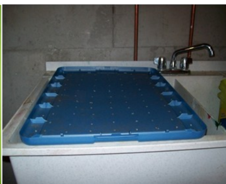
Plastic lid with holes in it