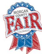
Exhibit at the County Fair!

Colorado State University Extension es un proveedor que ofrece igualdad de oportunidades. | Colorado State University no discrimina por motivos de discapacidad y se compromete a proporcionar adaptaciones razonables. | Office of Engagement and Extension de CSU garantiza acceso significativo e igualdad de oportunidades para participar a las personas quienes su primer idioma no es el inglés.