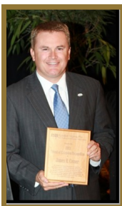
James Comer, KY