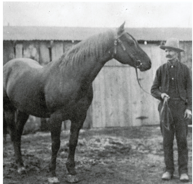
Peter McCue, A founding Quarter Horse sires in 1905, Oklahoma.

In Colorado, wild horse herds on the Western Slope that had begun with Núuchiu(Ute) horses, evolved as additional horses from American settlers, many with pedigreed European bloodlines, populated the herds.