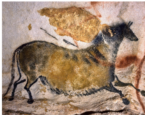
Image of a Horse in the Lascaux Cave, Ministère de la Culture, France.

This has implied that the evolution of Equus in all its iterations was halted in the western hemisphere (1). But not all equids disappeared from the archeological record. In Europe and Asia, Equus continued to evolve and was genetically like the North American species of Equus (2).