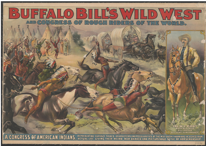
Buffalo Bill's Wild West Show Poster, 1899, Library of Congress.