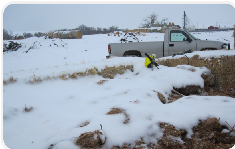
Snow on pile/bin, credit: Dafoe

While much of the northern plains and Rocky Mountains are dry for most of the year, there are periods when moisture can become excessive. Excess moisture is not so much an issue with the piles themselves but with traffic lanes and carbon sources. Carbon sources should be properly stored or covered if precipitation could saturate them. Carbon sources in the previously mentioned 40-60% moisture range are very ideal for mortality composting and continue to absorb moisture, preventing leaching. Excessively dry compost piles will actually shed water for a time before they begin to absorb moisture. Snow does not seem to affect the pile and may serve as an insulating blanket during periods of extreme cold. Bad weather, of course, can increase mortality and base piles should be constructed ahead of time in expectation of weather-related deaths.