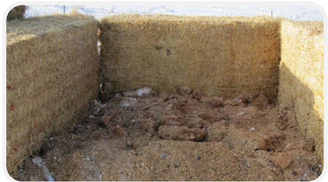
Bin and base

As previously mentioned, the size of a compost pile can be reduced through the use of bins or bunkers. Windrows and piles, provide the best passive air flow, however they will have the largest physical footprint and may pose the greatest attraction to predators and scavengers if the area is not appropriately fenced. The use of some type of structure to contain the area and reduce physical footprint is recommended. This also provides visual screening. Permanent, slatted wooden or metal walls can also be constructed for large carcasses, though it represents a greater expense. Some engineers recommend roofs over mortality compost bins, even in arid climates. A producer can discuss this and other compost facility decisions with their county agent or local USDA-NRCS conservation professional. Large square or round hay bales can be used to construct temporary bins; bales placed around the pile's perimeter help exclude pests and absorb any possible run-off. Bins for small ruminants, pigs or other stock could be built with small square bales. Temporary fencing or