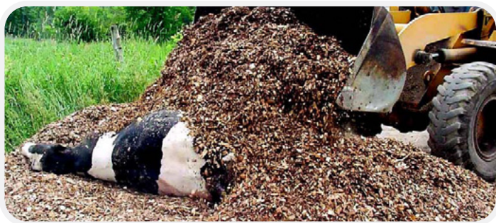
Cows on base