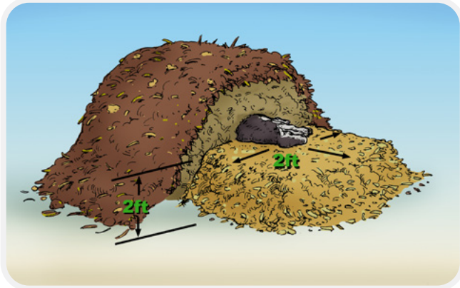
Cow position in pile

Estimates of total material needed to fully compost a mature cow are 12 cubic yards, or for 1,000 lbs of carcass, 7.4 cubic yards (200 ft 3 ). The difference in the estimates can be attributed to the thicker base recommended by some experts. Practically speaking, a proper base for a mature cow will be about 9 feet wide by 10 feet long. Once the mortality is placed in the middle of the base,