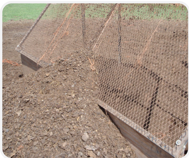
Home-made screen, credit: Bass

A screen is also helpful in improving final product quality, especially if the compost will be land applied. A screen allows for the separation of compost fines from residual bones and other trash such as baling twine, ear tags or other material. The simplest screen is a frame of angle iron with an expanded metal face. The face should be angled at 45 degrees or more, and elevated 1 to 5 feet off of grade with the top of the screen appropriate to the reach of the loader being used. The width should also be relative to the width of the bucket on the operation's loader. For example, screen area should be five to six feet wide by six to eight feet long, angled and elevated as previously described. More discussion of bones and screening is found in the Issues section of this document.