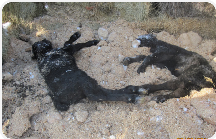
Calves on base

in the next section). The finished pile may reach up to six feet in height, in the example of a large cow. Small carcasses should be layered and arranged to maintain carbon margins around each dead animal. Small carcasses can also be stacked in tiers with carbon layers in between.