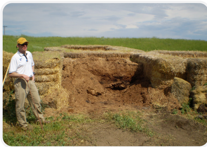
Bones remaining at 3 months, skull on left, spine on right. These will nearly breakdown completely when recovered for 3 more months, credit: Schauermaann

Size and volume of mortalities will directly influence the physical footprint of the pile or volume of bin space designed, amount of carbon material required, and the time required to fully compost the carcass(es). Smaller carcasses have more surface area relative to mass; this provides for more carbon material to carcass interaction. Similarly, cutting or breaking apart large carcasses can speed up the composting process. While properly constructed and layered poultry mortality compost will process in a matter of a few short weeks, cattle will take months (6-12) under average conditions (in static piles; i.e., no turning).