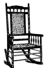
...not this one!