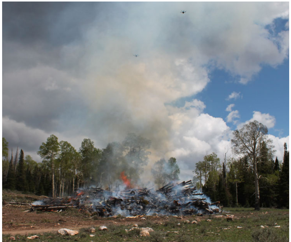
Traditional slash pile burning can damage soil, leading to a need for follow-up site rehabilitation. New, alternative biomass removal options like changing the way slash piles are constructed can prevent damage and create beneficial biochar in the process.

Scientists Debbie Page-Dumroese (from the Rocky Mountain Research Station) and Matt Busse (from the Pacific Southwest Research Station) collaborated with Forest Service managers from the Pacific Northwest Region, including woody biomass coordinator Jim Archuleta and air quality specialist Rick Graw, to develop an alternative method for building slash piles. Their goals were to reduce the amount, extent, and duration of soil impacts from burning and to create more charcoal for use in soil