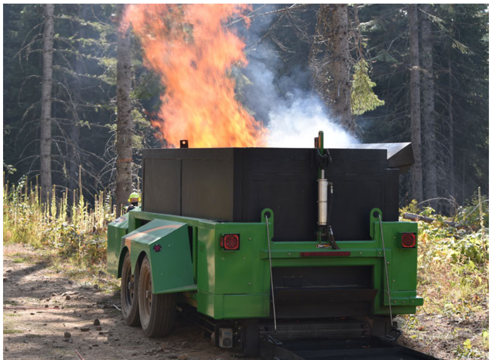
The CharBoss is an air curtain burner-style mobile biochar production machine that can consume material from most burn piles with minimal to no preparation.