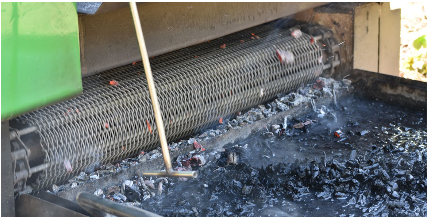
For land managers seeking solutions for implementing grassland restoration projects and hazardous fuels reduction projects, biochar is a promising product that can be the cornerstone of an organic matter redistribution system. In this photo, biochar is produced by the CharBoss, a mobile biochar processing air curtain burner.

This “A-Z guide” highlights recent Rocky Mountain Research Station (RMRS) science and covers methods to make biochar on site, including using piles, kilns, and air curtain burners. It also details three uses for biochar (agricultural, forest restoration, and mine land reclamation), and methods for application, including biochar spreaders.