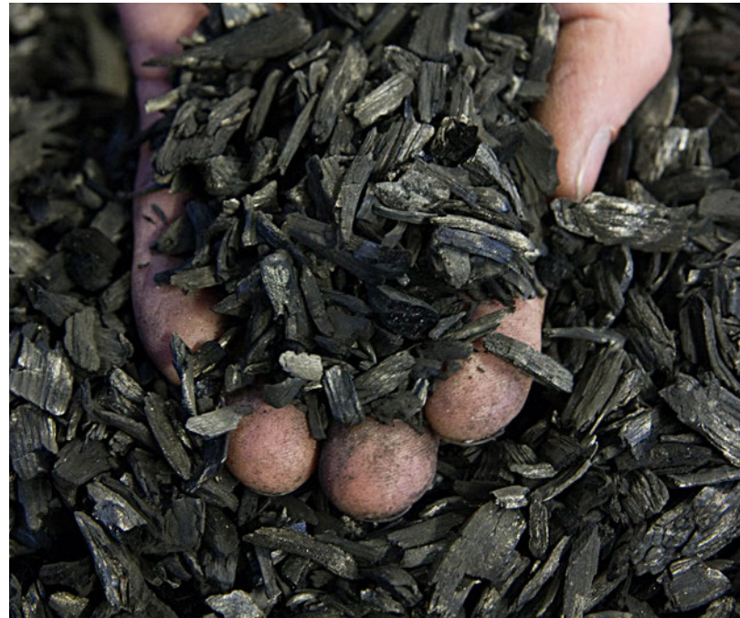
Biochar, shown above, is made from excess organic forest material and is proving to be a valuable economical and environmental resource.

By turning excess forest organic material into economically and environmentally valuable biochar, managers can redistribute the beneficial properties of the organic material from overgrown and unhealthy forests to soils in need of restoration. This process is a key piece of the restoration-economics puzzle. Rocky Mountain Research Station senior scientist Debbie Page-Dumroese says, "Creating a value-added product (biochar) from woody residues that are not valued can provide an economic return to landowners or entrepreneurs." Rocky Mountain Research Station Research Economist Dan McCollum's research shows, "Further, this can change the economics of forest treatments, such as thinning and fuel reduction