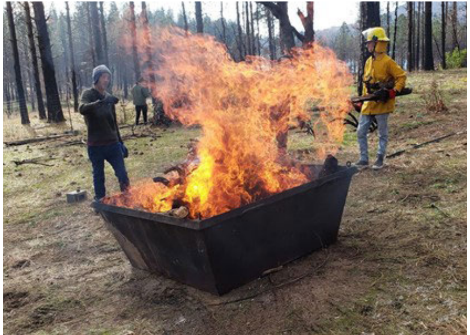
When open burning in kilns or slash piles, keeping a flame cap across the top of the burning material will reduce smoke and particulates.

Air curtain burners, also called air curtain incinerators or fireboxes, are another method for onsite biochar production. Page-Dumroese, Forest Service managers, and the U.S. Biochar Initiative worked with Air Burner Inc. to innovate ways to create useful biochar from woody biomass by using the air burner concept. The team was recently awarded a patent for their mobile biochar production system designed for their air curtain burner. The new system is called the CharBoss. Page-Dumroese says, “Mobile processing of woody residues into