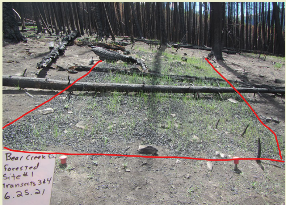
10 tons/acre of biochar was applied to only the first 20 feet of the 150-ft strip. This photo of a forested site captures the first 20 feet of the strip where biochar was applied denoted with red lines. The seed establishment stops where the biochar application ends.

difficult in the West because there are still few people making it, but many are interested in applications. “If you make it, they will come,” Salix says. “I’m guessing that if more folks start making biochar that we will be able to incorporate it more into our everyday restoration needs. If there is a curtain burner around, we will use it! Second, even small applications for pollinator islands may be a good option to get things going. Or having a demonstration garden at an office. People need to see it to believe it.”