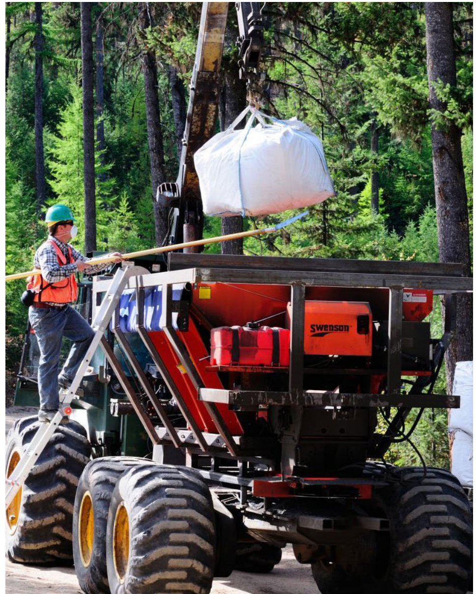
A high-capacity biochar spreader that can be mounted on a log forwarder and used on skid trails and log landings to distribute biochar has been developed by RMRS scientists and the Missoula Technology and Development Center.

be applied in increments, so that the soil is not “overloaded” with biochar. Therefore, one application may not be sufficient when mixed with the residual soil during mine land restoration, but soil and biochar testing will determine site-specific needs.